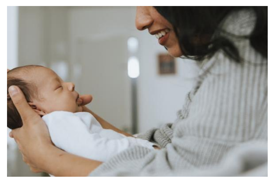
We welcome feedback from birthing people, partners and family members around their experiences of maternity care and services received across Rochdale and Oldham.