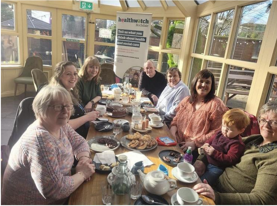
Healthwatch Rochdale staff and Volunteers pictured at their “Volunteer Coffee and Cake Catch up” Event at The Baum, Rochdale.