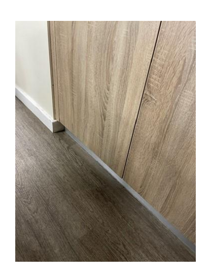
Very clean floors

The manager described a number of ways in which they ensure that the environment is suitable for the needs of the residents, they ensure the home is hygienic and clean through audits. The manager explained they do daily room and home checks. In addition, describing how the housekeepers have designated areas they are responsible for. All bedrooms and areas are cleaned daily and ensure all areas are "bottomed 2 times a month." The residents are prone to infection and so they are very keen to maintain high standards of cleanliness throughout the home.