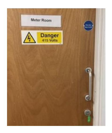
Concern: key left in door of meter room