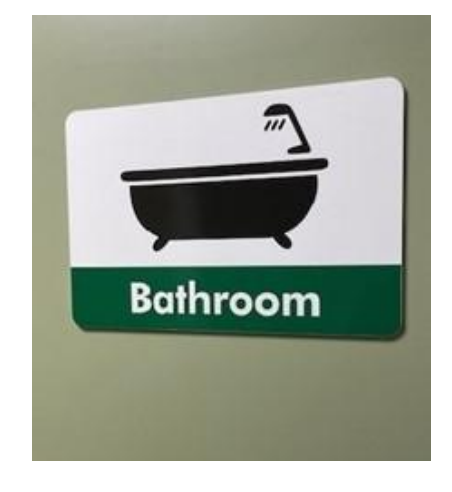
Large eye level easy read dementia friendly signs on doors -consistent throughout.

clients also seemed to really like them. Staff were identified as wearing brightly coloured polo tops, though there was no colour coding for the different job roles. Staff mentioned tabards are worn when carrying out specific duties e.g. giving medication though we did not observe any staff wearing these during the visit.