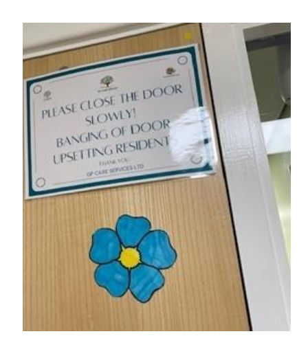
Dementia friendly signs on doors -consistent throughout.

The Willows has a dementia-friendly design with bright corridor colours selected