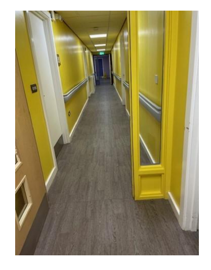
Entrance to residents' area

Examples she gave were encouraging family feedback on decor (with them choosing the colours for the corridors), and the personalisation of the resident rooms. Alongside specific changes based on feedback, like changes to the laundry procedures and name tagging, were introduced in response to family concerns In