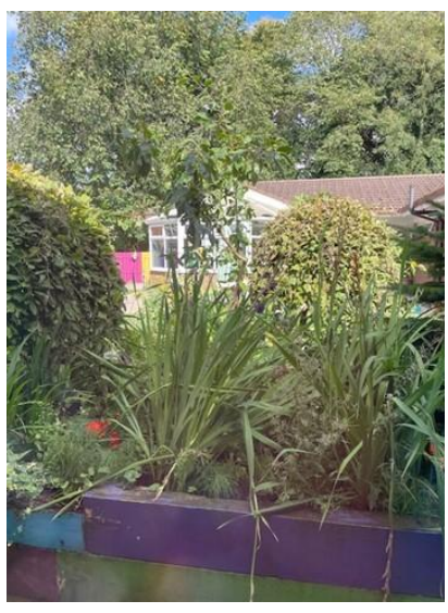
Garden at the Willows