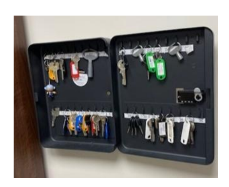
<u>Concern:</u> Labelled Key Box left open

These concerns were raised with the managers at the debriefing session with the Enter and View Team.